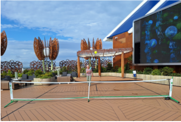
Penny on the cruise playing pickleball - so who fetches the ball when it goes overboard?